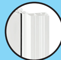
2" RENO Also available in 1 1/2"