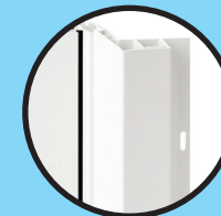
1 3/8" EXTENDED