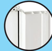
3 1/2" 180