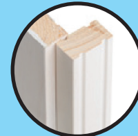
2" PRIMED WOOD DOOR