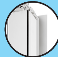
FLUSH FRAME EXTENSION